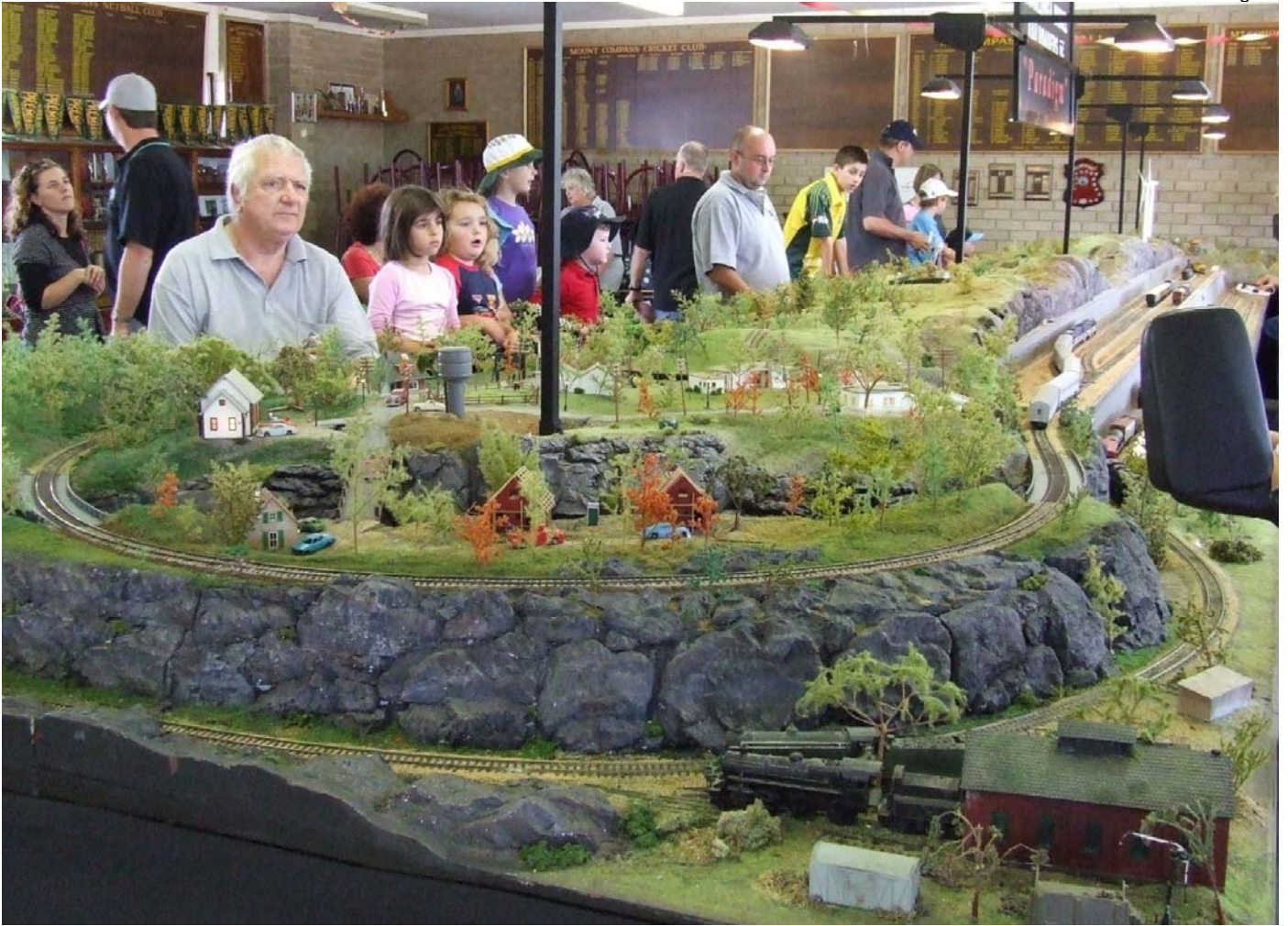
Two more photos of our display at Mt Compass. These small displays are the perfect opportunity to let the public get some hands on experience, and let us promote our coming events and sometimes pick up some new members.