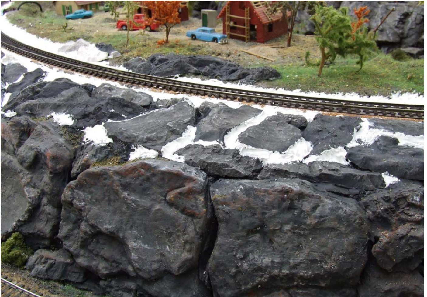
A couple of photos of the newly laid track on Paradigm, above with snow on the rocks and later once it had melted and the grass was starting to grow