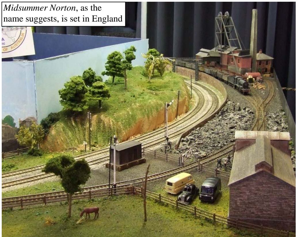
Midsummer Norton, as the name suggests, is set in England

As space is running short other photos will have to wait for a future issue. Now that our website is back up and the member's gallery functional I will try to get the photos loaded to it. Aaron has probably beaten me to it and already filled up a couple of albums from the trip.